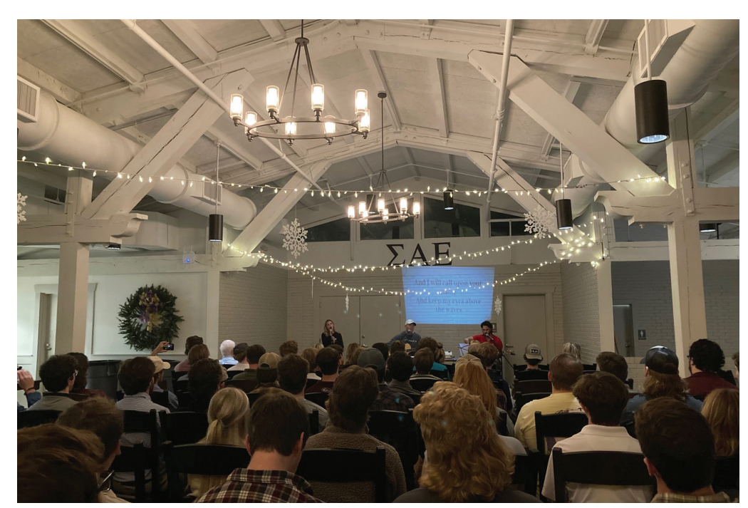
Brothers and friends enjoying a night of Christmas fellowship in the "new" Great Hall.