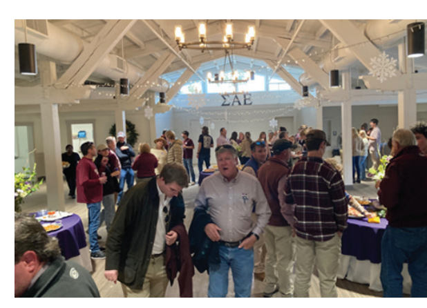
The new house exceeds alumni expectations and will serve as a great home for active members.