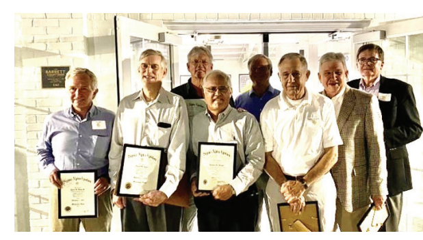
Members of the 1970 and 1971 classes were honored for 50 years of \Sigma AE membership.