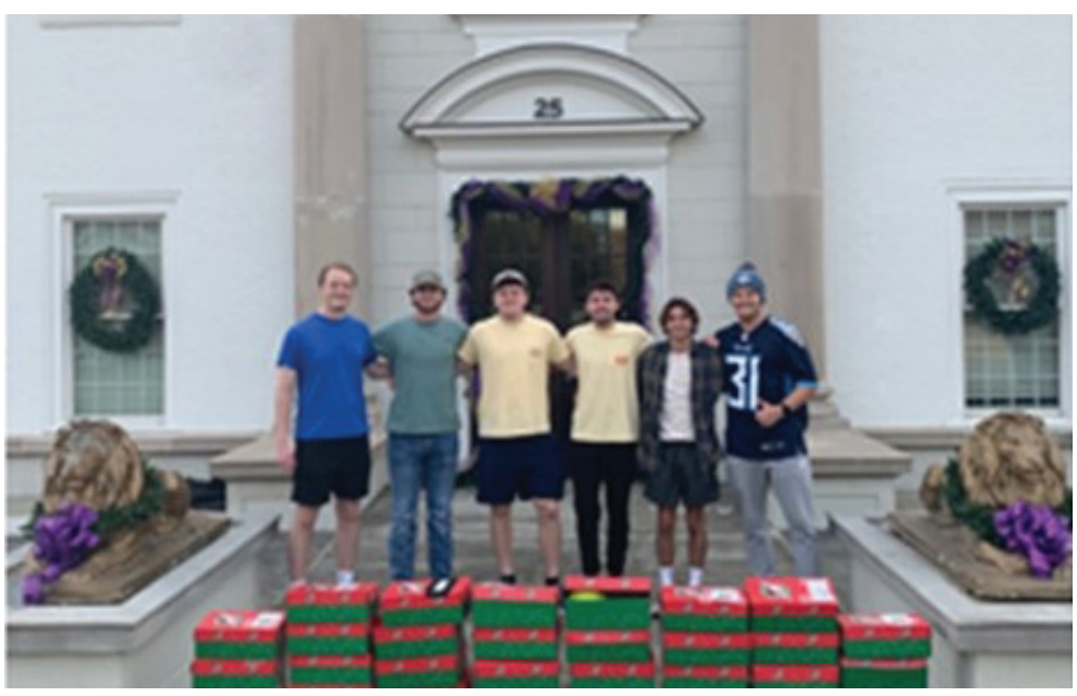
Brothers attending the dedication party for our new E-Hut.