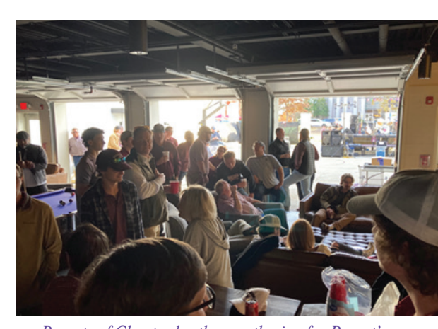
Parents of Chapter brothers gathering for Parent's Weekend during the weekend of the Kentucky game.