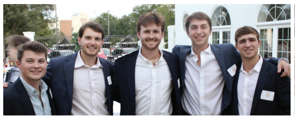
Brothers attending the dedication party for our new E-Hut.